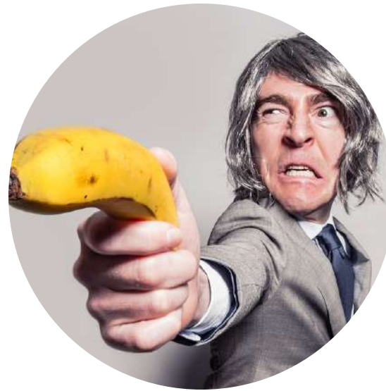
VAR MODEL (Value added resource)